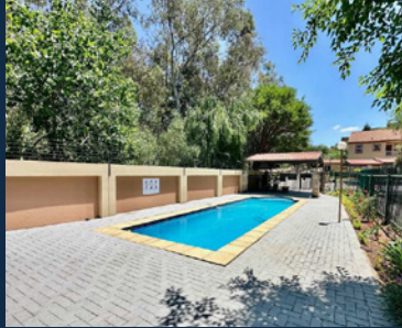
Sunninghill R849 000