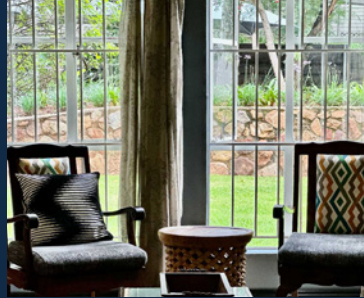
Melville R900 000