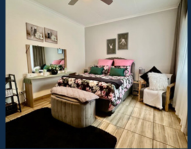
Oakdene R989 000