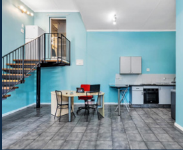
Auckland Park R529 000