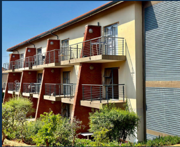
Willowbrook R295 000