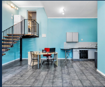
Melville R549 000