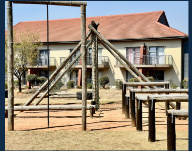
Ruimsig R625 000