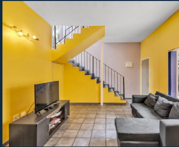
Melville R529 000